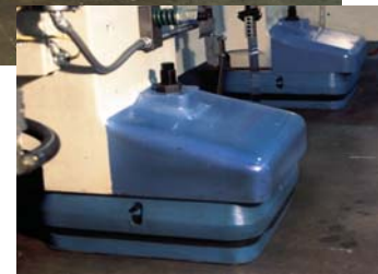
Installation of a high-speed press on VSML Isolators